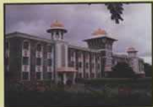
Shivaji University, Kolhapur